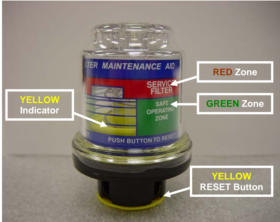
Figure 2-1. FILTER MAINTENANCE AID – (ABOVE) “YELLOW Indicator” position relative to SAFE OPERATING ZONE (“GREEN Zone”) or SERVICE FILTER (“RED Zone”) markings defines current filter condition and pushing “YELLOW RESET Button” resets indicator. (BELOW) FMA unit is mounted to inner frame of IBF assembly and can be viewed through access window in the upper fairing.